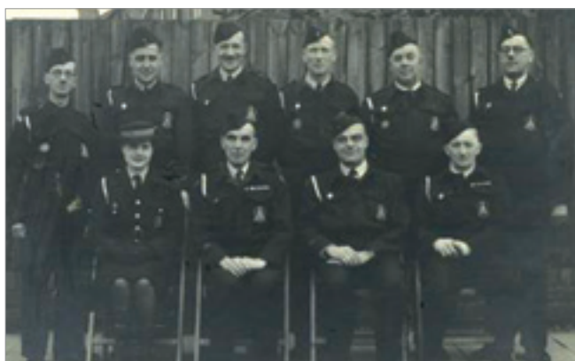
The Coventry Fire Guard instructors, 1944