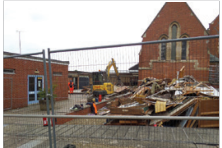
The Portakabin next to the Chapel has gone!