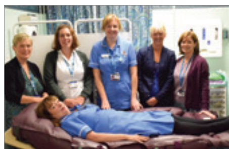
Hover mattress for the Orchard Centre team courtesy of SWFT NHS Turst