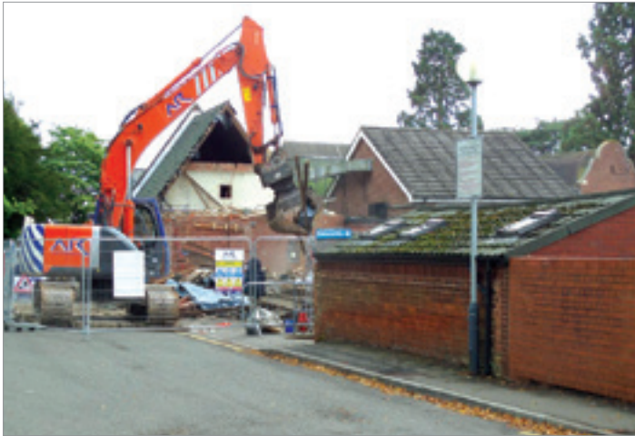
Demolition of the CSSD building on 15th September

More pictures of the progress of the project can be found on our Facebook page.