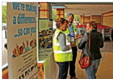
In store collection at Sainsbury's by George Ballard